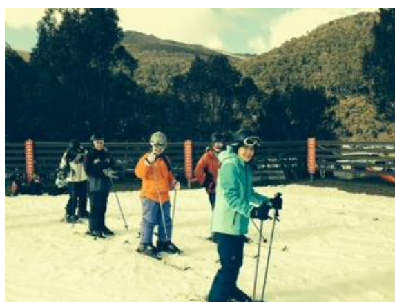
Year 8 students on the ski slopes