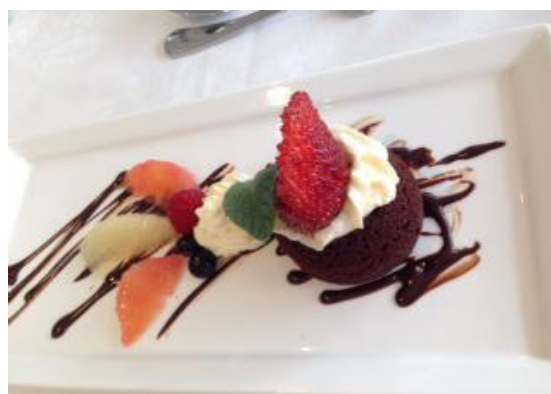
Warm Chocolate Cake at The Apprentice Restaurant Ultimo TAFE