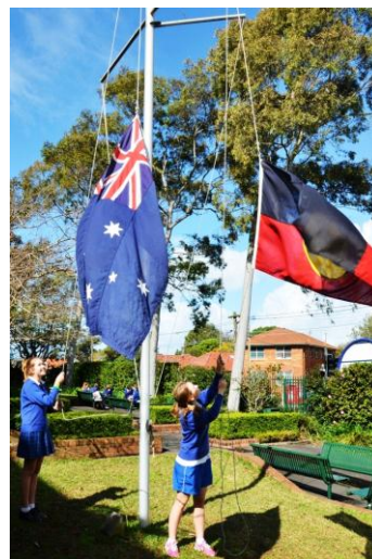
Chloe, Year 8 and Odina, Year 9 SRC members raising the flag