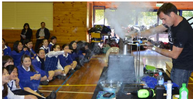
Year 8 students enjoying the experiments performed by the Surfing Scientist