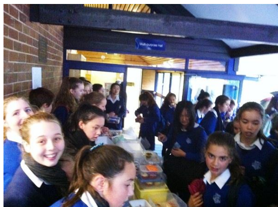
Students enjoying RSPCA National Cup Cake Day